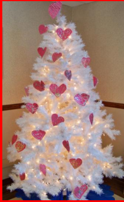
The Valentine Tree