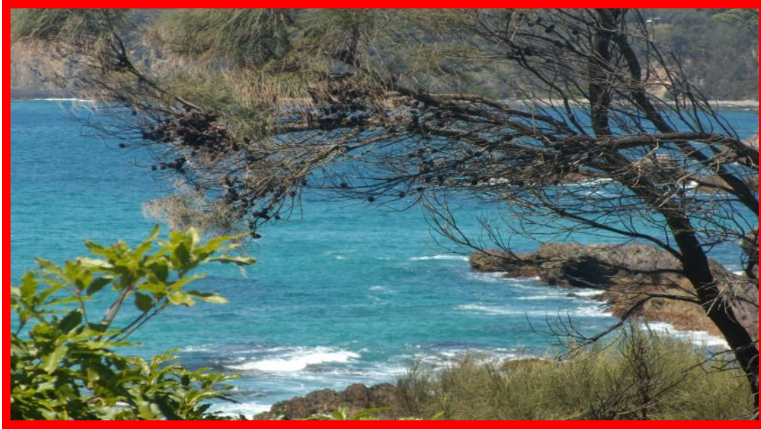
A stunning photo from Julie' s trip to Australia