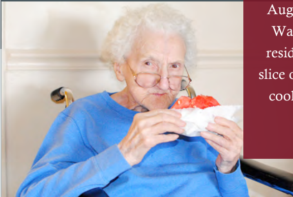
August 3 rd was National Watermelon Day. Our residents enjoyed a juicy slice of watermelon to help cool down from the hot summer sun.