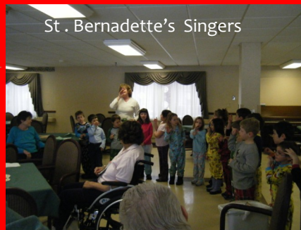
St. Bernadette's Singers

The children from St. Bernadette's helped us make Valentines . Since it was "Pajama Day" at their school, they came to see us in their jammies and sang songs complete with animation. They were so cute and the residents really enjoyed their visit. Thank you for sharing with us.