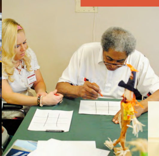
A fun game of Tick-Tack-Toe keeps our brain sharp and focused.