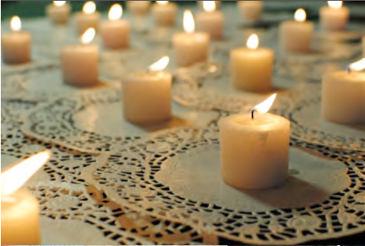
We held our Fall Memorial Service in honor of those that have gone before us.